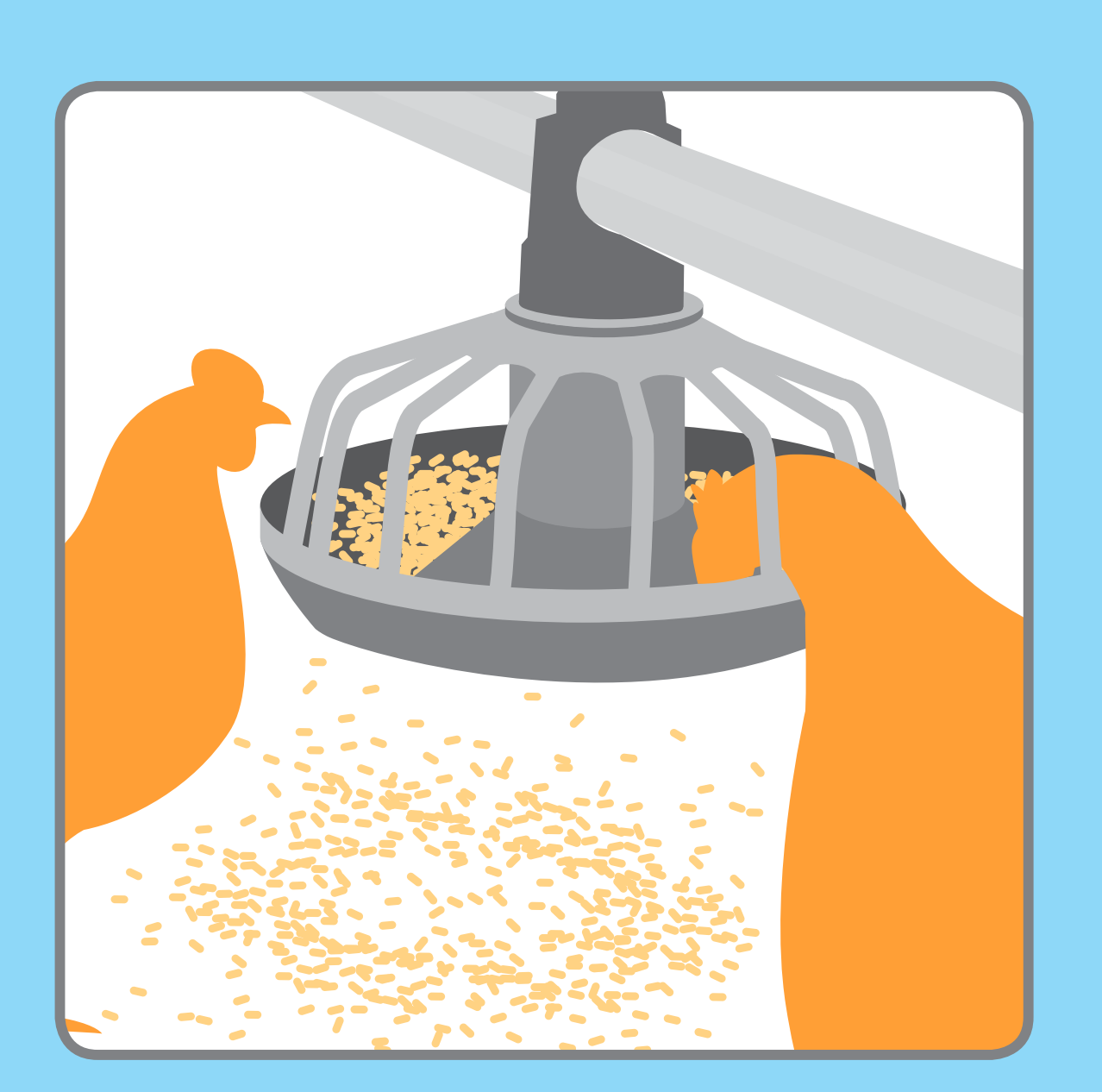
Clean up feed spilage