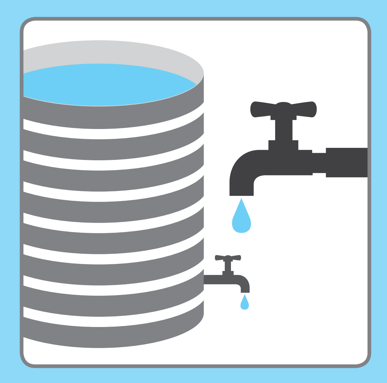
Untreated drinking or cooling water