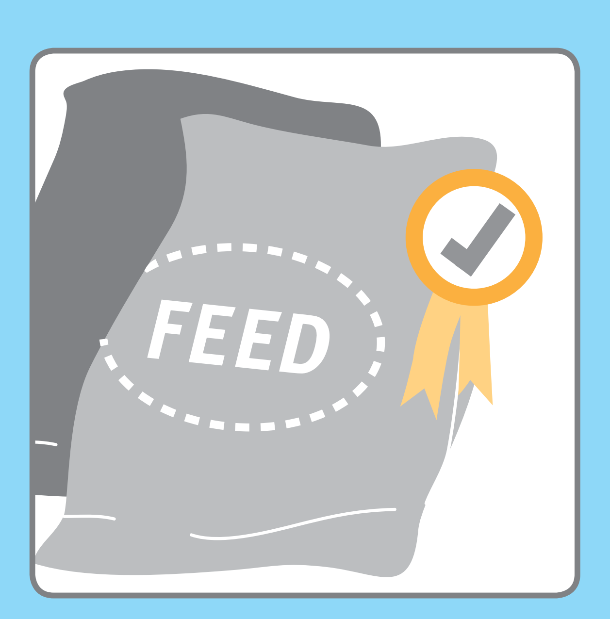
Certified feed supplier