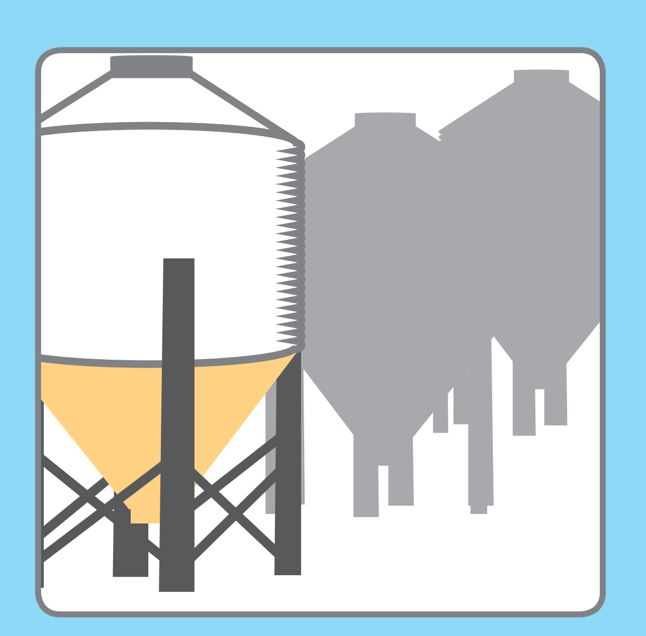
Covered feed storage